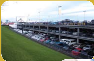
Below Grade Parking Structures, Elevator Pits and Slabs