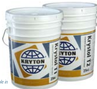
Krystol T1 & T2® are available in 25 KG (55lbs) buckets.

Paths for harmful moisture and aggressive chemicals are blocked. Permanently.